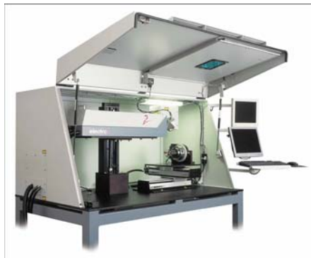
Customised Maxim workstation