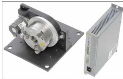
Rotary Work Holding