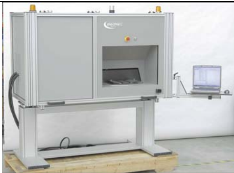
Axiom workstation with turntable

Table top workstations: Choice of welded steel enclosures with hinged door